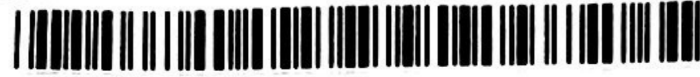
EXHIBIT A REPLATTED UNITS C-120 and C-130 Mountaineer Square Condominiums Mt. Crested Butte, Colorado.